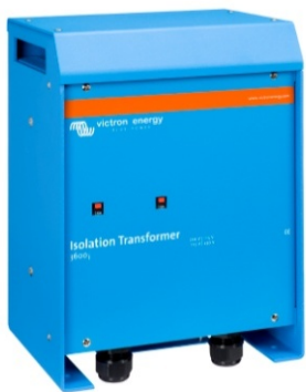
Isolation Transformer 3600W